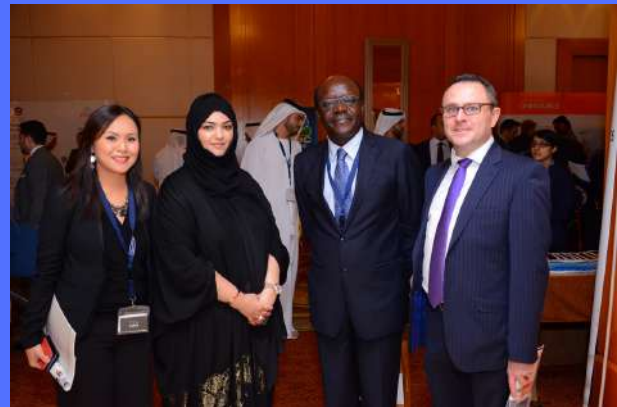
UAE Ministry of Economy & KW Group hosting Dr Mukhisa Kituyi, Director General UNCTAD