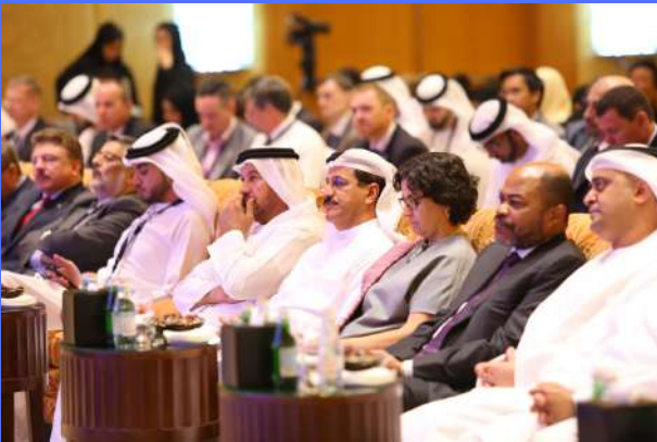
Ministers & Trade Leaders attending GTDW Middle East