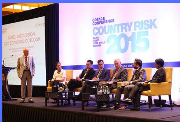
KW Group organised COFACE Middle East Country Risk Conference for 400 Trade Finance Professionals