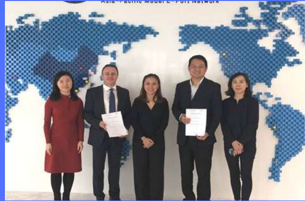
MOU Signing between APMEN, China & KW Group