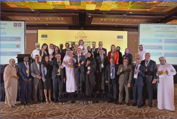
Islamic Development Bank, Arab Ministers Meeting hosted by UAE Ministry of Economy & KW Group